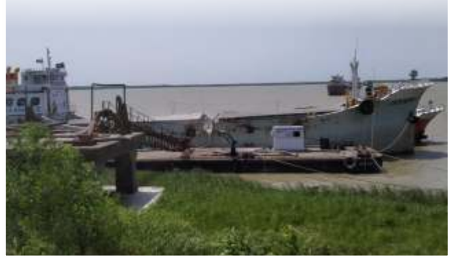
WAI Haldia Jettie

April 26, 2020 and was notified to relevant stakeholders in the Eastern and North-Eastern Region including shippers, freight forwarders, terminal operators, and allied service providers as also to CII, FICCI, ASSOCHAM and others to utilise inland waterways on the IBP route.