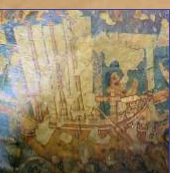
Painting of a three-mast sail ship at Ajanta Cave No.