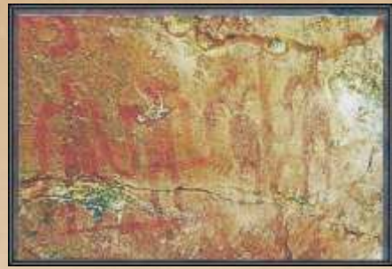
Painting of A Boat in Kilvalai Rock Shelter in Tamil Nadu

The cave at Chamardi village in Bhavnagar district