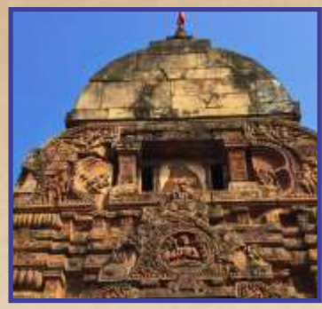
Vaithal Deol, Bhubaneswar, Odissa

those days. One can find two boats carved on the pillars of the eastern and western toranas of the Sanchi stupa. The structure carved on the Southern face of the northern pillar of the western gateway suggests that of a royal ship or a big seagoing vessel that may have been used for overseas trade. On one of the pillars of the Amaravati stupa is the carving of a ship with a cabin in the middle containing sacred relics of Lord Buddha placed on a throne.