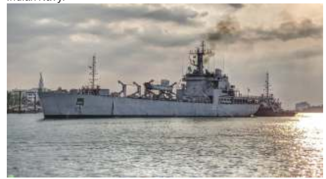
The second Indian Navy ship under 'Operation Samudra Setu'-INS Magar with 202 evacuees from

The repatriation being an ongoing process, various State Governments have ensured that adequate arrangements have been made for onward travel to hospitals/institutional quarantine centres/home quarantine by deploying ambulances, state transport buses and taxis. These arrangements are being coordinated by the respective district administration, police and health departments, in consultation with port authorities and the Indian Navy.