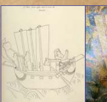
Illustration of a boat from the right wall of Cave No. 2 at Ajanta from James Burgess' 'Original Drawings from the Buddhist Rock Temples at Ajanta'

Ancient Indian ships have been best represented through the Jataka stories painted on Ajanta caves. The paintings of the ships are found in the caves numbered 1, 2 and 17. Varieties of ships and boats have been depicted through paintings, thus, depicting pleasure-seeking boats, seagoing ships for trade and travel, ships used for naval warfare along with small canoes. One of the ships with three masts in full sails is one of the best and most comprehensive representation of a sailing ship in Indian art. A mural in Cave No. 17 shows two small boats with three masts. The wreckage of a boat due to running aground on a coral reef can be made out in the picture.