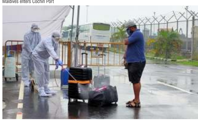
Cochin Port Trust Officials Disinfecting Luggage of Indian Repatriates