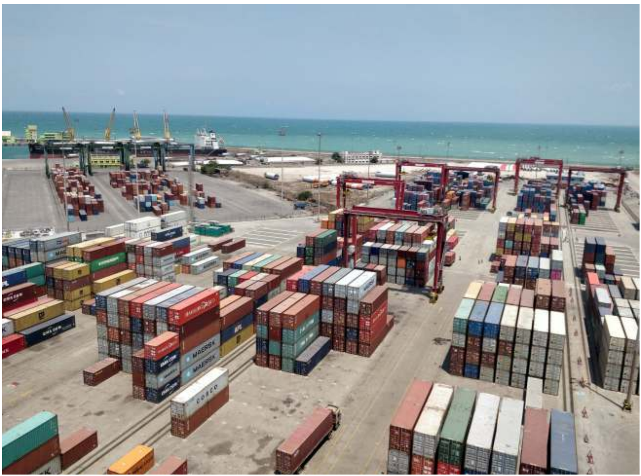
Containers Stacked at Container Terminals at an Indian Ports

Adopting advance payments as opposed to credit basis may be the new 'mantra'.