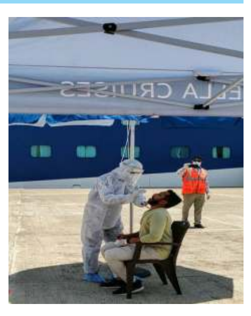
Health Checkup of Indian Crew Disembarked at Mumbai Por