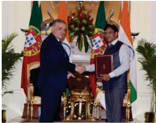
India & Portugal sign Agreement on maritime transport, ports