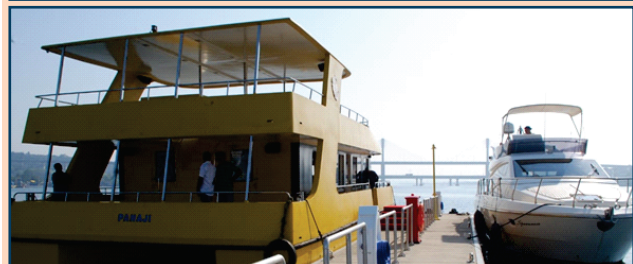
Shri Mansukh Mandaviya, Minister of State for Shipping (I/c) Inaugurating the Concrete Floating Jetty in Goa