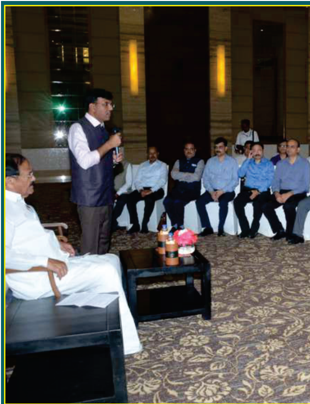
'Chintan Baithak' - Ports Review Meeting with Chairpersons of All Major Ports