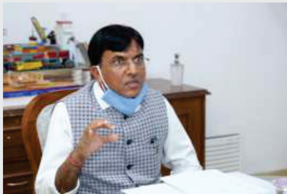
Shri Mansukh Mandaviya, Minister of State for Shipping (I/c) and Chemical & Fertilizers Reviewing Port Preparedness over Coronavirus Pandemic

block the entry of the virus from this entry point as well. Secondly, 95 per cent of India's export/import trade takes place by sea. To keep the logistic supply lines open and ensure there is no disruption in the availability of goods and commodities, ports need to continue to be operational as an essential service provider to the nation. With these two aspects in view, SOPs were drawn up to be followed by all ports.