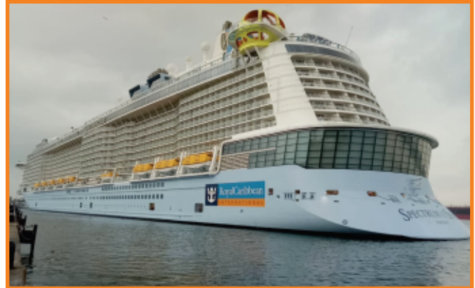
Spectrum of the Seas entering Cochin Port