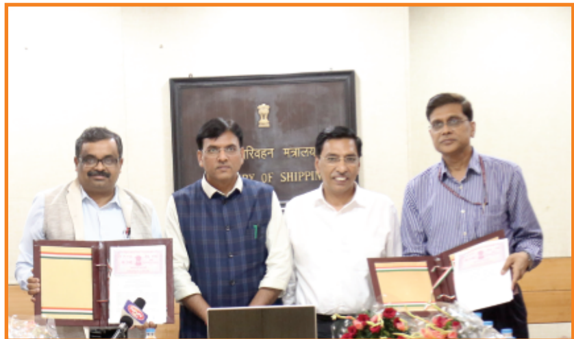
Ministry of Shipping signs an agreement with IIT Kharagpur for setting up CICMT

The programme funded to the tune of Rs 69.20 crores by the government would allow modern technologies for inland water transportation and cargo haulage through coastal shipping. Explaining the purpose of setting up CICMT at IIT Kharagpur, Shri Mansukh Mandaviya, the Minister of State for Shipping (I/C) and Chemicals & Fertilizers said, "To boost 'Make in India' drive of the Prime Minister and develop advanced vessels on the latest technology here in India, we will set up Centre for Inland and Coastal Maritime Technology (CICMT) at IIT Kharagpur. So far, only a few nations such as Germany, Netherlands, Russia and Belgium possess these technologies and excel in maritime research. The facility can be used not just by Indian shipyards, but also by shipyards outside India as well."