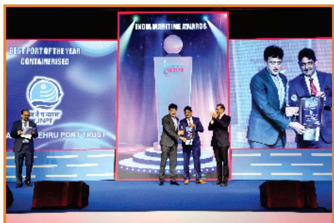
JNPT awarded for its quality services in container cargo transport