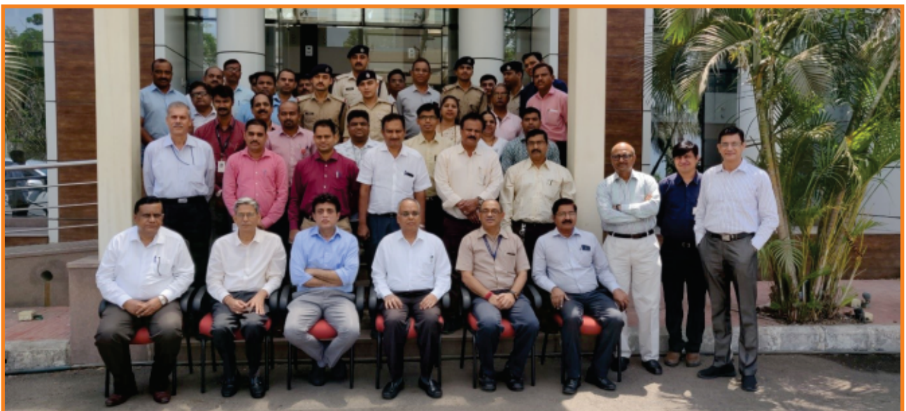
Focus on training of seaport emergency handlers

Security issues must never be ignored. Keeping this in mind, Jawaharlal Nehru Port Trust (JNPT) in conjunction with the Indian Ports Association (IPA), National Disaster Management Authority and Institute of Nuclear Medicines and Allied Sciences conducted a training programme on "CBRN Emergency Management" for seaport emergency handlers. The four-day programme included information on the safety and regulatory aspects of the CBRN materials in the port. More than 40 personnel from the JNPT, private port operators, tank farms and CISF in addition to other stakeholders participated in the port's efforts directed at issues related to port vulnerability, psychosocial issues with CBRN emergencies and demo activities at seaport.