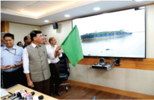
Shri Mansukh Mandaviya digitally flags off MV AAI along Brahmaputra river