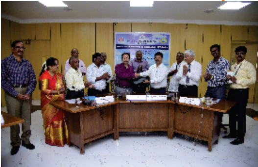
Exchange of MoU between VoCPT and CWC