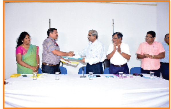
Paradip Port to setup desalination plant for community welfare

The Ministry of Shipping (MoS) is keen on implementing Coastal Community Development, an important pillar of the Sagarmala project, considering a chunk of the country's population lives in the coastal areas. In a bid to do away with the current water crisis affecting various Indian states, the Paradip Port Trust (PPT) is setting up the first state-of-the-art 10 million litres per day desalination plant in Odisha. In this regard, an MoU was signed between PPT and National Institute of Ocean Technology (NIOT), Chennai under Ministry of Earth Sciences, Govt. of India on July 15, 2019.