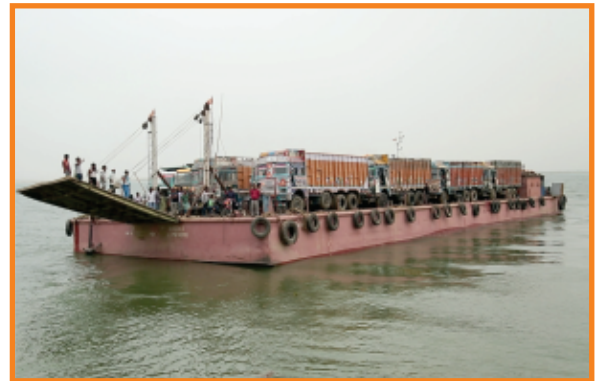
More cargo to be transported through Inland Waterways

The Ministry of shipping is set to develop, in a phased manner, the technically viable 111 National Waterways, for increasing shipping and navigation. The focus on using waterways for national transportation of cargo and passengers has led to enhanced cargo haulage on waterways to 72.31 MT in 2018-19 from 55.20 MT in 2016-17 a growth of 30% in the past three years.