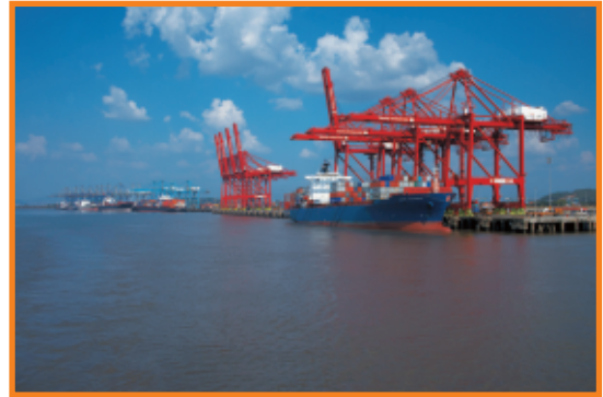
JNPT creates record in container cargo handling

Upgradation and expansion of infrastructure at our ports, over the past few years, as part of the Sagamala Programme has led to improved operational performance and would shift cargo movement from road and rail to coastal shipping, in due course.