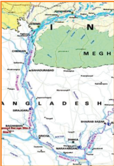
The Indo-Bangladesh Protocol Route marked in blue

For the first time in Indian history, an Indian waterway was used to move cargo between two countries as MV AAI sailed along the Indo-Bangladesh Protocol routes. The use of inland waterways to transport cargo from our landlocked neighboring country Bhutan, to Bangladesh is a significant move in terms of ease of transportation and reduced logistics costs. Speaking on the occasion, Shri Mansukh Mandaviya, the Minister of State for Shipping (I/C) and Chemicals & Fertilizers said, "The move will be beneficial to India as well as Bhutan and Bangladesh and strengthen relations between the neighbouring countries. The transportation of cargo through this route will cut short travel time by eight to ten days and reduce transportation cost by 30 per cent, thus, bringing down logistics costs," adding, "It will also be a more environment-friendly mode of transport."