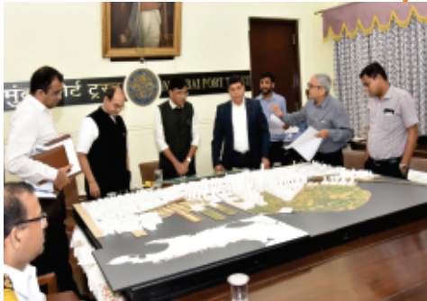
Shri Mansukh Mandaviya with Mumbai Port officials