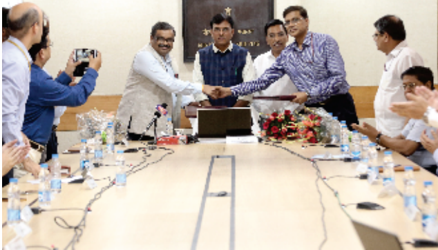
Signing of MoU between IIT Kharagpur and MoS