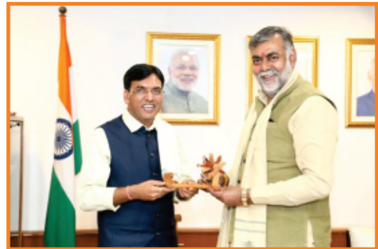
Shri Mansukh Mandaviya meeting Shri. Prahlad Singh Patel to discuss prospects of maritime tourism

A committee comprising of senior officials of both the Ministries has been set up to explore the avenues for coastal tourism in the country.