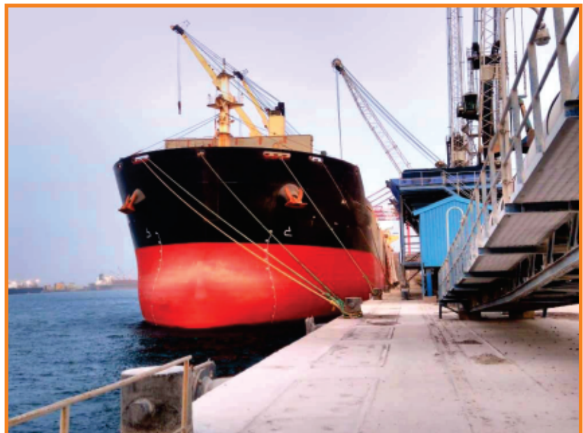
V.O. Chidambaranar Port handles record amount of cargo