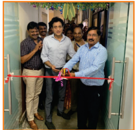
Unveiling of new container terminal data centre at JNPT

Jawaharlal Nehru Port Trust continues to advance its development plans as it added a new Data Center for Container Terminal on May 03, 2019. The new data centre has been designed with a futuristic approach and is supported by advanced technical infrastructure, thus, enabling smooth integration of technology into port operations. The centre launched by JNPT is an additional step towards enhancing its operational efficiency necessary for providing efficient service coupled with ensuring "Ease of Doing Business" for the EXIM community.