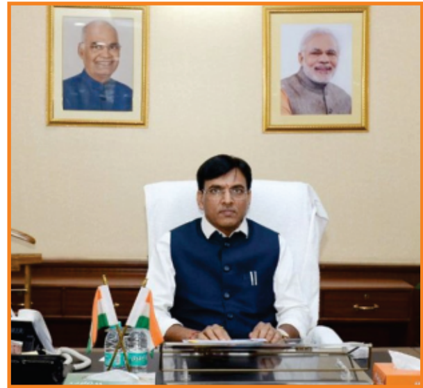
Shri Mansukh Mandaviya, Union Minister of State for Shipping (I/c)

There is an ardent need to develop India's maritime infrastructure to ensure increased movement of cargo through coastal shipping and use of the country's inland waterways. Keeping this in mind, the Union Ministry of Shipping has unveiled a roadmap that would cater to India's projected cargo traffic of 2,500 MMTPA by 2025.