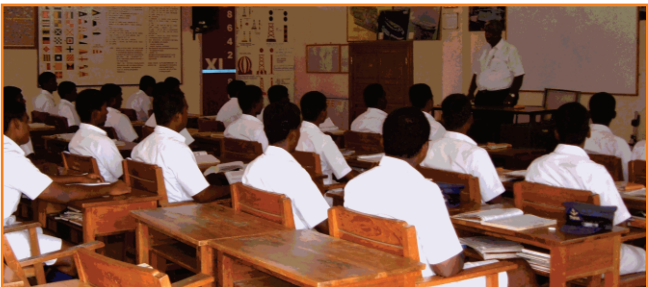
Maritime institutes told to give practical training to seafarers

The Shipping Ministry has directed maritime training institutes across the country to provide the skills and necessary practical training to seafarers. Moreover, terms and conditions have been relaxed to ensure increased availability of vessel slots to train students interested in working with the maritime sector.