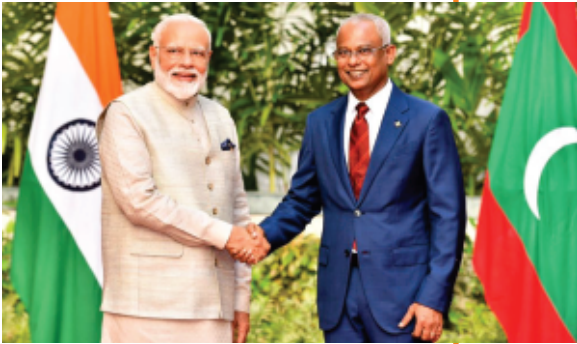
India signs MoU with Maldives to boost Maritime Logistics