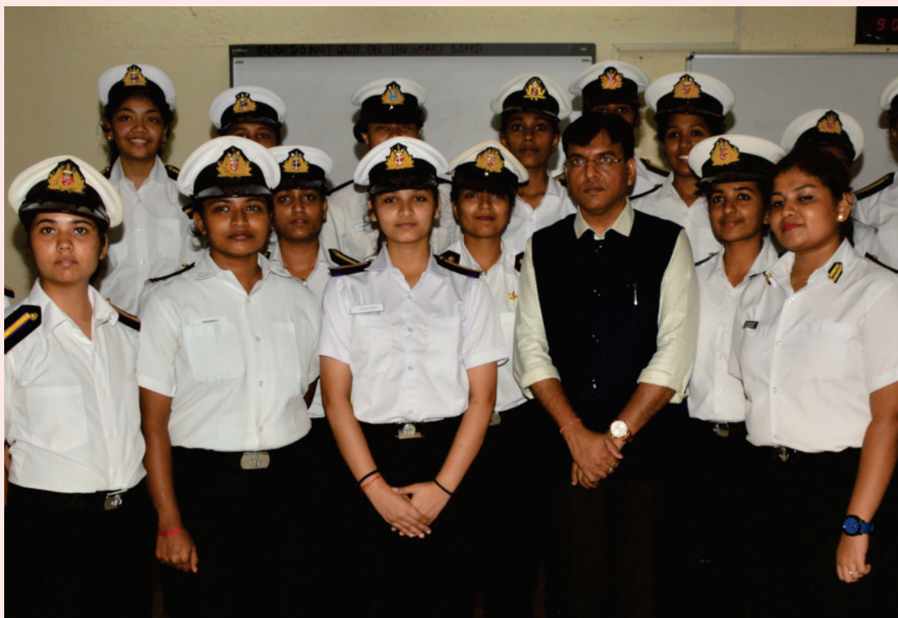
Shri Mansukh Mandaviya with women seafarers

Addressing the country on the World Maritime Day 2019, Shri Mansukh Mandaviya, Minister of State for Shipping (I/c) and Chemicals & Fertilizers spoke of the respect and empowerment the Indian culture had accorded to women. Extending greetings to all women seafarers, he said they were showing equal enthusiasm and bravery in serving the nation.