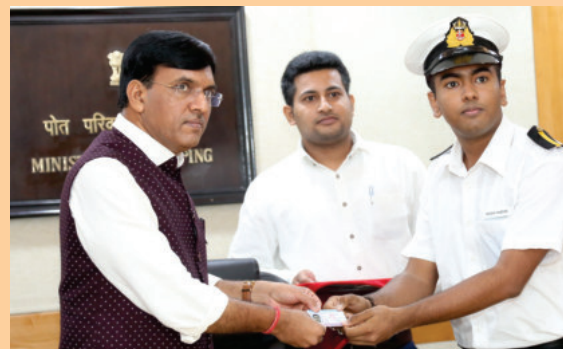
Shri Mansukh Mandaviya hands over BSID to seafarers

In another event that marked the gradual progress of the Indian shipping sector, India became the first country in the world to issue a Biometric Seafarer Identity Document (BSID) to its seafarers. At the launch event held on August 28, 2019, at New Delhi, Shri Mansukh Mandaviya, Minister of State for Shipping (I/c) and Chemicals & Fertilizers handed over the new BSID cards to five Indian seafarers.