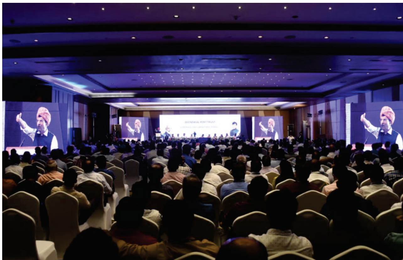
Shri Mansukh Mandaviya addressing Deendayal Port officials at SIPC, Gandhidham