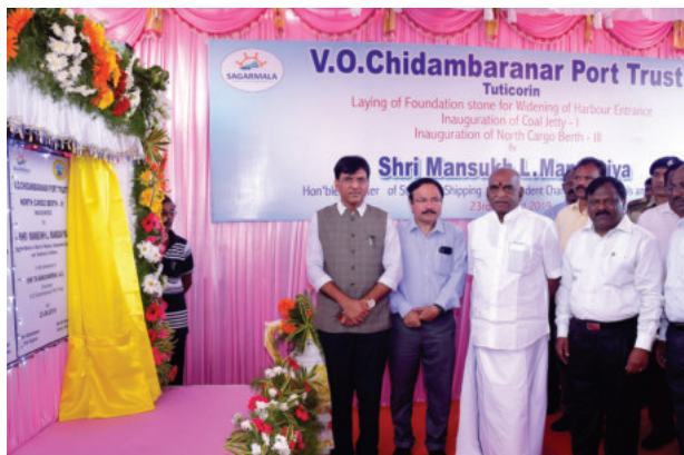
Shri Mansukh Mandaviya with VO Chidambaranar Port officials