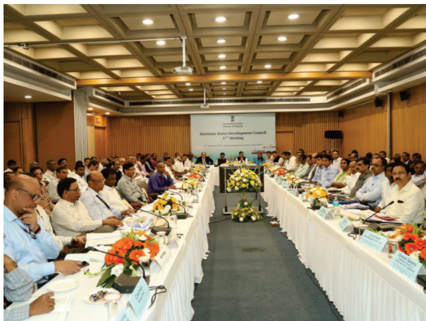
Shri Mansukh Mandaviya at the Maritime States Development Council meeting at New Delhi

The Ministry of Shipping organized the 17 th meeting of the Maritime States Development Council (MSDC) at New Delhi on October 15, 2019. During the meeting arranged to develop a National Grid for ports based on synergy between India's major and minor ports, Shri Mansukh Mandaviya, Minister of State for Shipping (I/c) and Chemicals & Fertilizers called for revival of the ports that are not yet operational. Shri Mandaviya said, "There are 204 minor ports in the country, of which only 44 are currently functional. All these ports have been centres of maritime activity in the past, and if revived, they can once again become important centres of sea trade. The Government is looking at developing synergy between the major and minor ports so that together they can bring port-led development in the country."