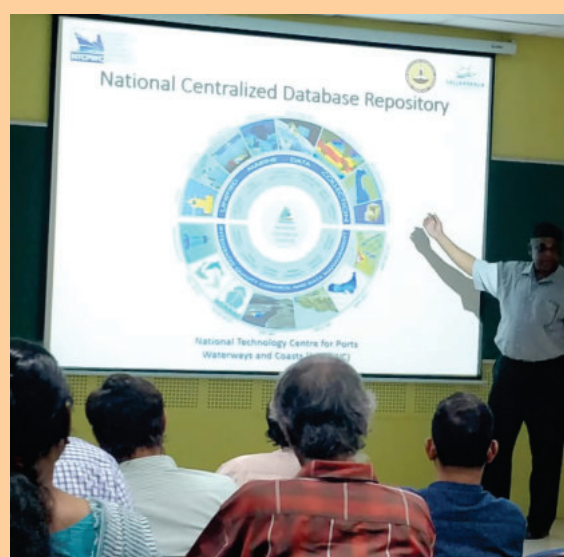
Training programme on the CIRIA manual at the joint meeting between IPA & NTCPWC