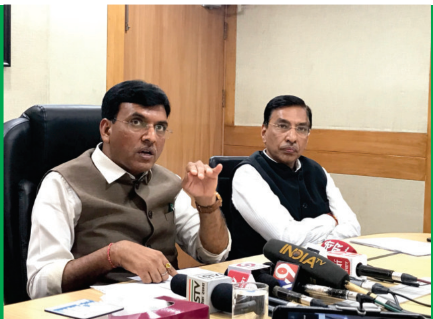
Shri Mansukh Mandaviya addressing the media about the benefits of the SOP between India & Bangladesh

Shri Mansukh Mandaviya, Minister of State for Shipping (I/c) and Chemicals & Fertilizers recalled how the Prime Minister Shri Narendra Modi's foreign policy initiative concerning the use of Chattogram and Mongla Ports in Bangladesh for cargo movement to and from India will ensure lower costs of shipments to and from the country's Northeastern states in addition to reducing time and distance for transport of goods.