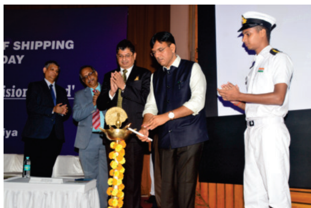
Shri Mansukh Mandaviya at the 70 th Foundation Day of the Directorate General of Shipping

The Directorate General of Shipping celebrated its 70 th Foundation Day on September 03, 2019 amidst much celebration at an event in Mumbai. At the event organized to acknowledge its contributions to the shipping sector, Shri Mansukh Mandaviya, Minister of State for Shipping (I/c) and Chemicals & Fertilizers along with other officials discussed ways to encourage safe, secure and pollution-free shipping.