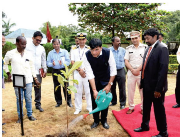
Shri Mansukh Mandaviya plants a sapling at the Mormugao Port