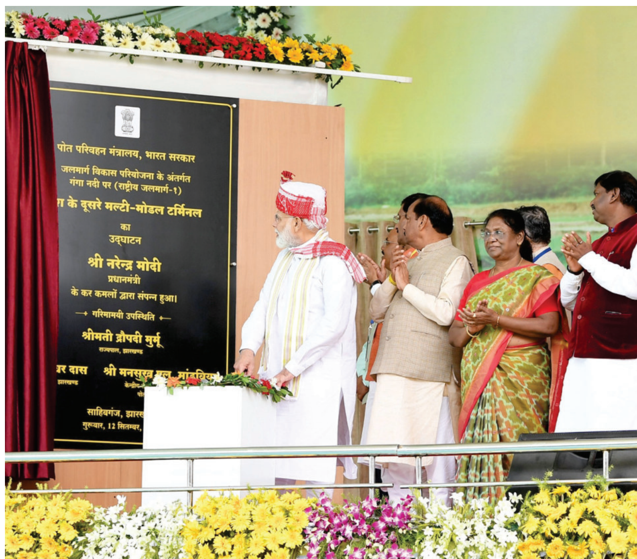
Hon'ble Prime Minister Sh. Narendra Modi with Jharkhand Governor Smt. Droupadi Murmu & Chief Minister Shri Raghubar Das at the inauguration of Sahibganj Multi-Modal Terminal

The current capacity of the terminal is expected to grow to 5.5 MMTPA after capacity expansion in Phase II by the PPP model. Around 335 acres of land has been designated for the construction of a freight village, contiguous to the terminal.