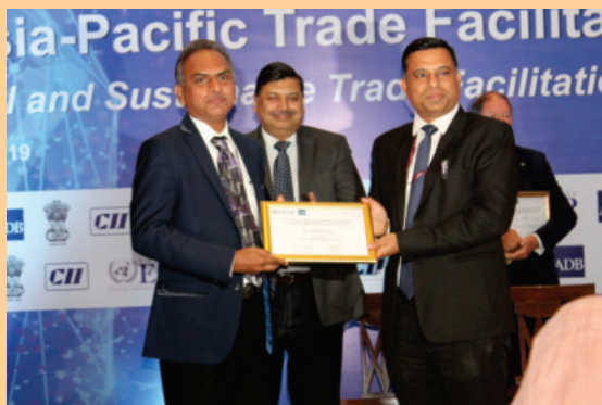
Tuticorin CFS Association recognised for installation of CoDEX at VOC Port

The Tuticorin CFS Association was conferred the “International Trade Facilitation Innovation Award” for the successful installation of Container Digital Exchange system (CoDEX) at the VO Chidambaranar Port at a function organised by Asia Pacific Trade Facilitation Forum (APTFF) on September 18, 2019 at New Delhi. The event was organised by the Asian Development Bank (ADB), United Nations Economic and Social Commission for Asia and the Pacific (ESCAP) in partnership with the United Nations Conference on Trade and Development (UNCTAD), World Customs Organization (WCO) and World Trade Organization (WTO).