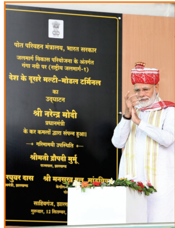
Hon'ble Prime Minister Shri Narendra Modi inaugurating Sahibganj Multi-Modal Terminal

Constructed in less than two years at a cost of Rs. 290 Cr in Phase I, this second of the three multi-modal terminals has been built on the NW-1 under the Jal Marg Vikas Project (JMVP) in record time.