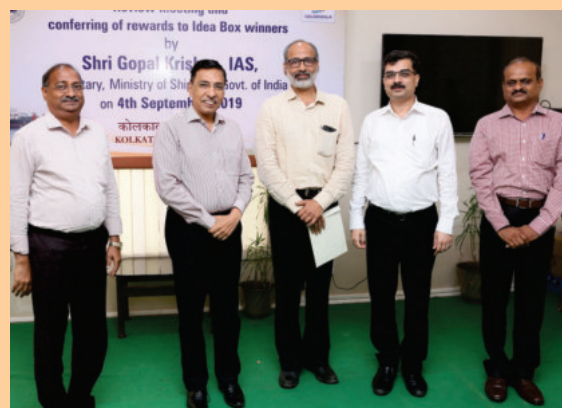
Ideabox Challenge winners awarded at Kolkata Port Trust

With a view to seek innovative ideas and out-of-the-box solutions to improve existing processes, increase revenue, boost tourism and implement a green energy model, KoPT launched the Ideabox Challenge. Over 200 ideas, covering various aspects of port operations were received of which the top three winners were awarded a cash prize of Rs. 50,000 each while six consolation prizes were also given out to encourage those who had participated in the challenge.