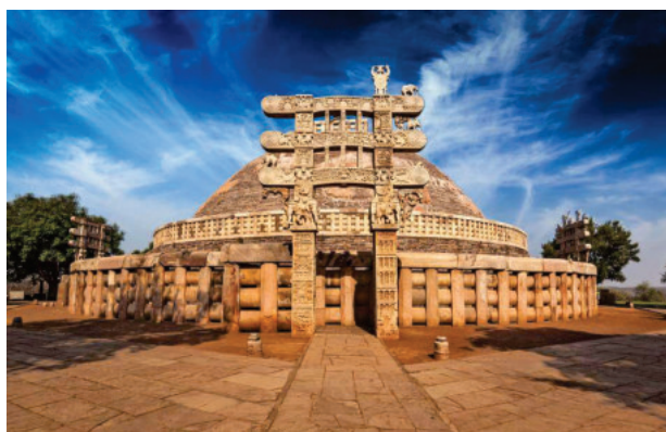
Sanchi Stupa built during the Mauryan age

Sea trade began during the latter half of the Mauryan period. In addition to focusing on exports and imports, the Mauryan rulers engaged in the shipbuilding business and hired them out to merchants for commercial purposes.