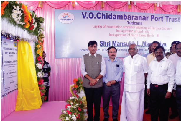
Shri Mansukh Mandaviya with VO Chidambaranar Port officials