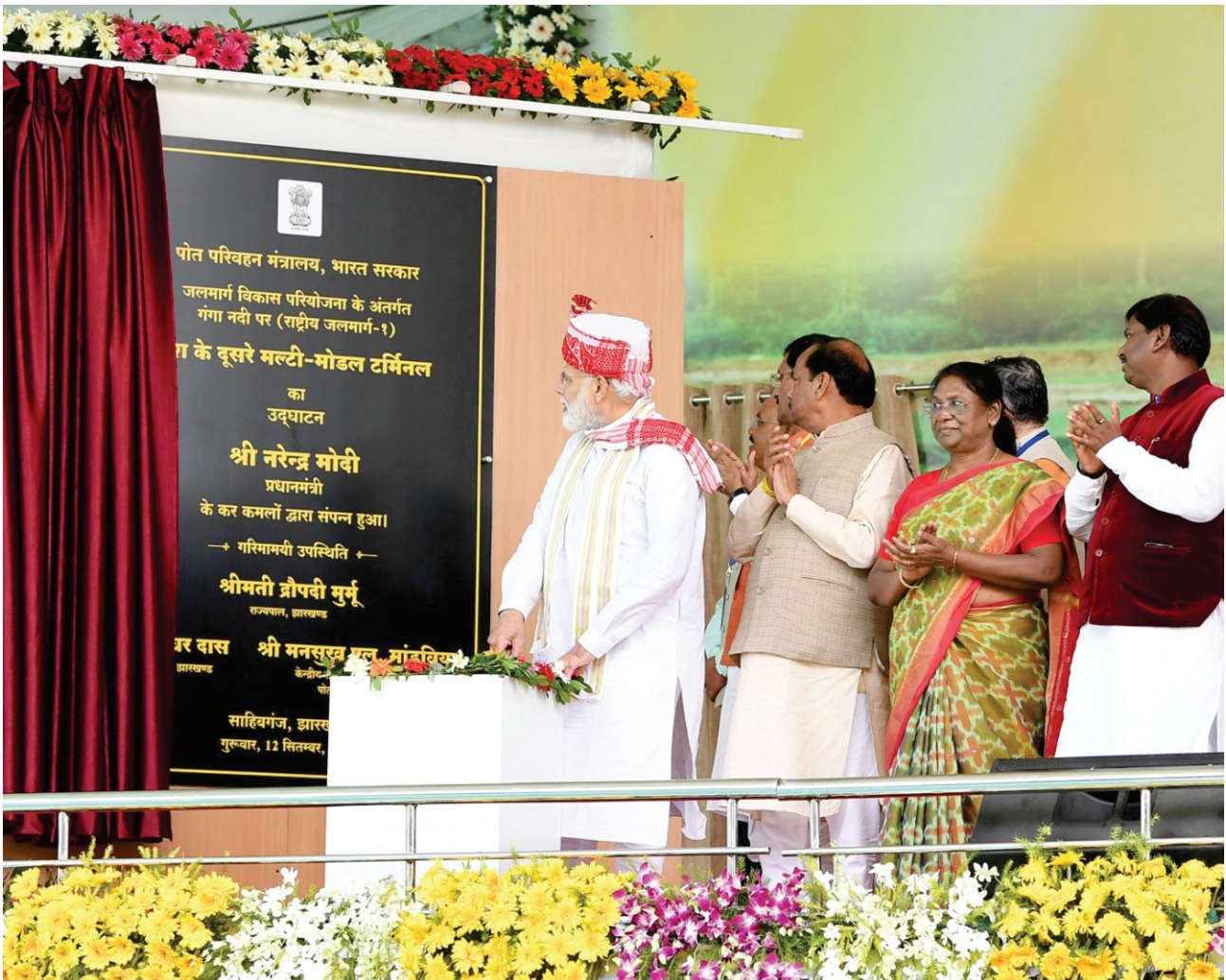
Hon'ble Prime Minister Sh. Narendra Modi with Jharkhand Governor Smt. Droupadi Murmu & Chief Minister Shri Raghubar Das at the inauguration of Sahibganj Multi-Modal Terminal

The current capacity of the terminal is expected to grow to 5.5 MMTPA after capacity expansion in Phase II by the PPP model. Around 335 acres of land has been designated for the construction of a freight village, contiguous to the terminal.