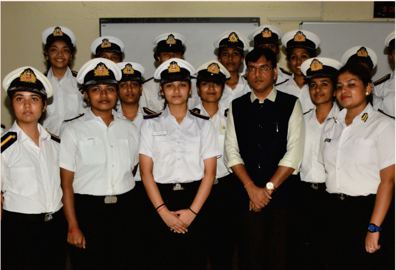
Shri Mansukh Mandaviya with women seafarers

Addressing the country on the World Maritime Day 2019, Shri Mansukh Mandaviya, Minister of State for Shipping (I/c) and Chemicals & Fertilizers spoke of the respect and empowerment the Indian culture had accorded to women. Extending greetings to all women seafarers, he said they were showing equal enthusiasm and bravery in serving the nation.