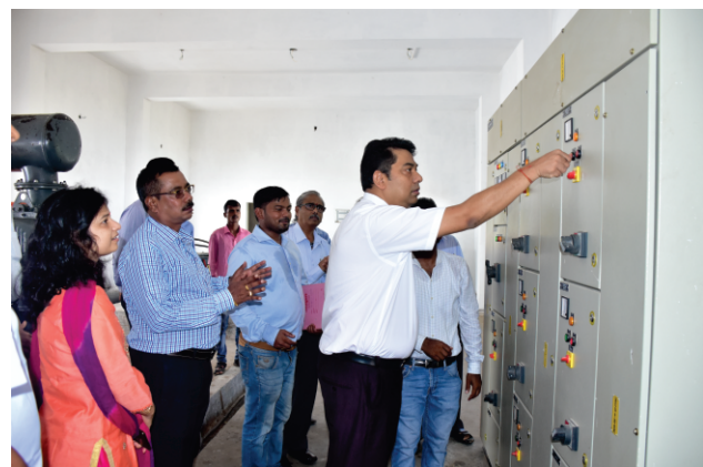
Paradip Port Chairman at the port's sewage treatment facility

In sync with Indians' determination to keep their environment clean, the Paradip Port has conducted trials on two sewage treatment plants, each with a capacity of 4.5 million litres daily. These two plants are state-of-the-art facilities and have been constructed at an estimated cost of nearly Rs. 22 crores.