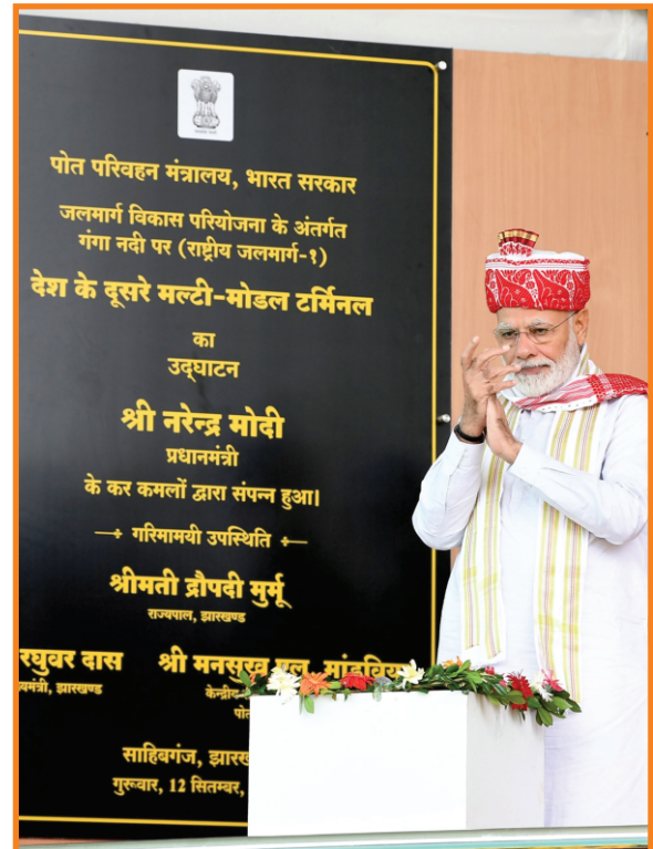
Hon'ble Prime Minister Shri Narendra Modi inaugurating Sahibganj Multi-Modal Terminal

Constructed in less than two years at a cost of Rs. 290 Cr in Phase I, this second of the three multi-modal terminals has been built on the NW-1 under the Jal Marg Vikas