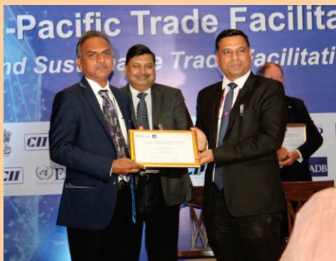
Tuticorin CFS Association recognised for installation of CoDEX at VOC Port

The Tuticorin CFS Association was conferred the “International Trade Facilitation Innovation Award” for the successful installation of Container Digital Exchange system (CoDEX) at the VO Chidambaranar Port at a function organised by Asia Pacific Trade Facilitation Forum (APTFF) on September 18, 2019 at New Delhi. The event was organised by the Asian Development Bank (ADB), United Nations Economic and Social Commission for Asia and the Pacific (ESCAP) in partnership with the United Nations Conference on Trade and Development (UNCTAD), World Customs Organization (WCO) and World Trade Organization (WTO).