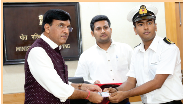
Shri Mansukh Mandaviya hands over BSID to seafarers

In another event that marked the gradual progress of the Indian shipping sector, India became the first country in the world to issue a Biometric Seafarer Identity Document (BSID) to its seafarers. At the launch event held on August 28, 2019, at New Delhi, Shri Mansukh Mandaviya, Minister of State for Shipping (I/c) and Chemicals & Fertilizers handed over the new BSID cards to five Indian seafarers.