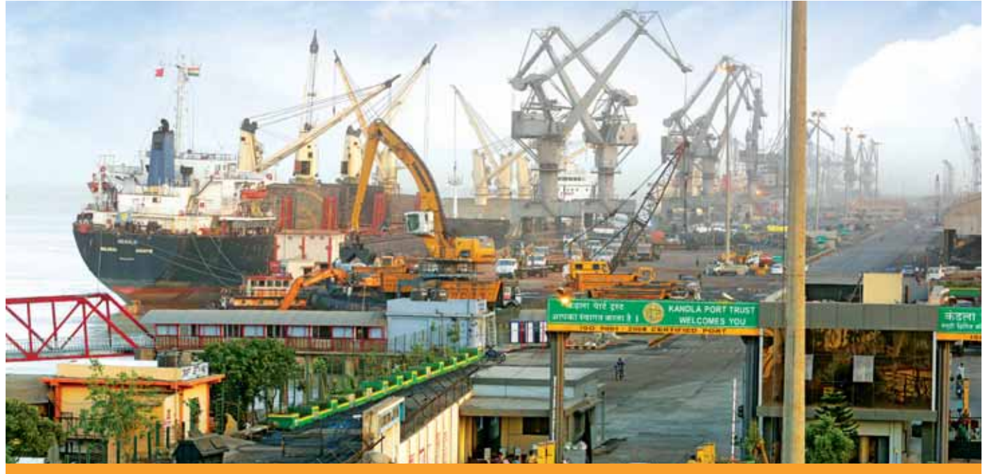
A view of Deendayal Port

The Standing Finance Committee of the Ministry of Shipping has cleared the proposal for the project and the facility is expected to be commissioned by October 2020.