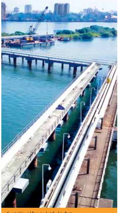
Coastal Liquid Terminal at Cochin Port