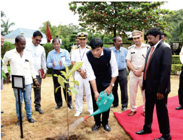
Shri Mansukh Mandaviya plants a sapling at the Mormugao Port