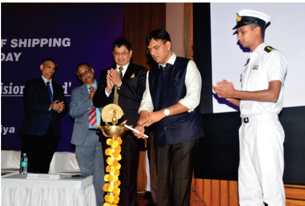
Shri Mansukh Mandaviya at the 70 th Foundation Day of the Directorate General of Shipping

The Directorate General of Shipping celebrated its 70 th Foundation Day on September 03, 2019 amidst much celebration at an event in Mumbai. At the event organized to acknowledge its contributions to the shipping sector, Shri Mansukh Mandaviya, Minister of State for Shipping (I/c) and Chemicals & Fertilizers along with other officials discussed ways to encourage safe, secure and pollution-free shipping.