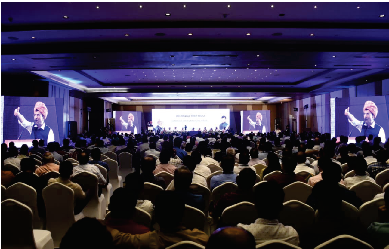
Shri Mansukh Mandaviya addressing Deendayal Port officials at SIPC, Gandhidham