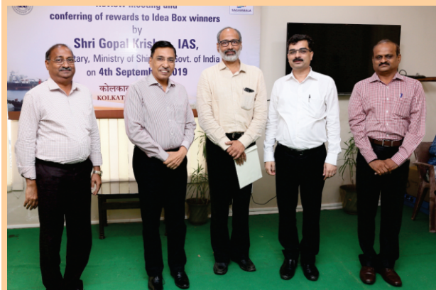
Ideabox Challenge winners awarded at Kolkata Port Trust

With a view to seek innovative ideas and out-of-the-box solutions to improve existing processes, increase revenue, boost tourism and implement a green energy model, KoPT launched the Ideabox Challenge. Over 200 ideas, covering various aspects of port operations were received of which the top three winners were awarded a cash prize of Rs. 50,000 each while six consolation prizes were also given out to encourage those who had participated in the challenge.