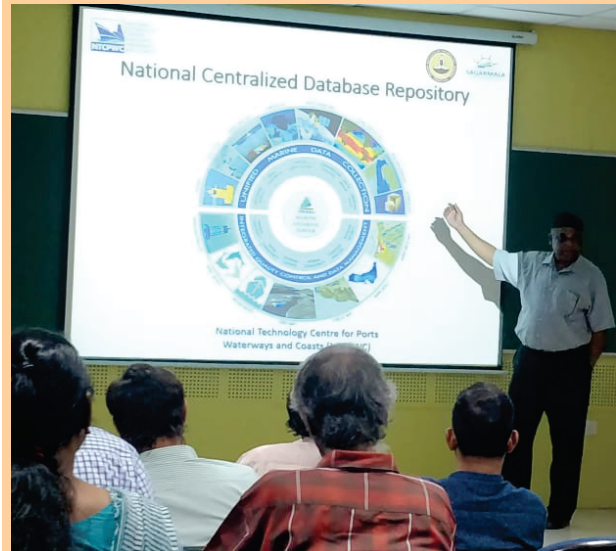
Training programme on the CIRIA manual at the joint meeting between IPA & NTCPCW